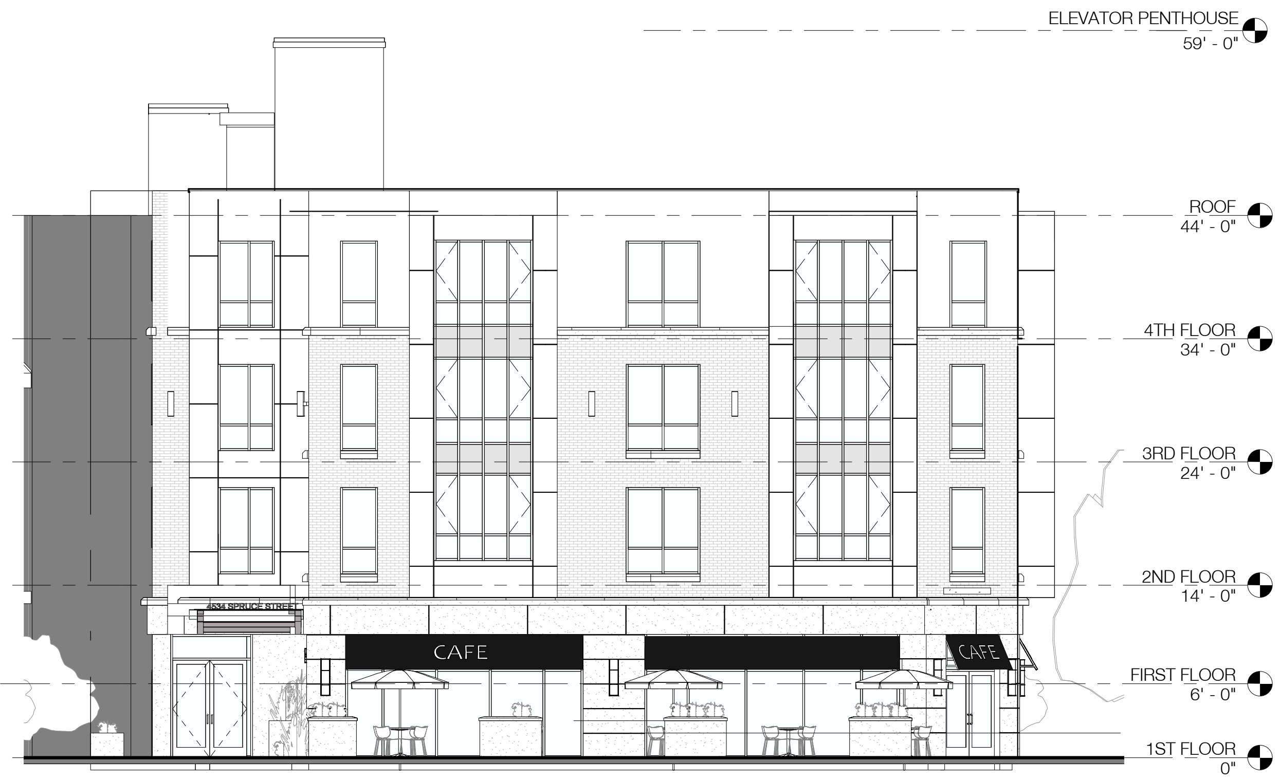
3 NORTH ELEVATION 1/8" = 1'-0"