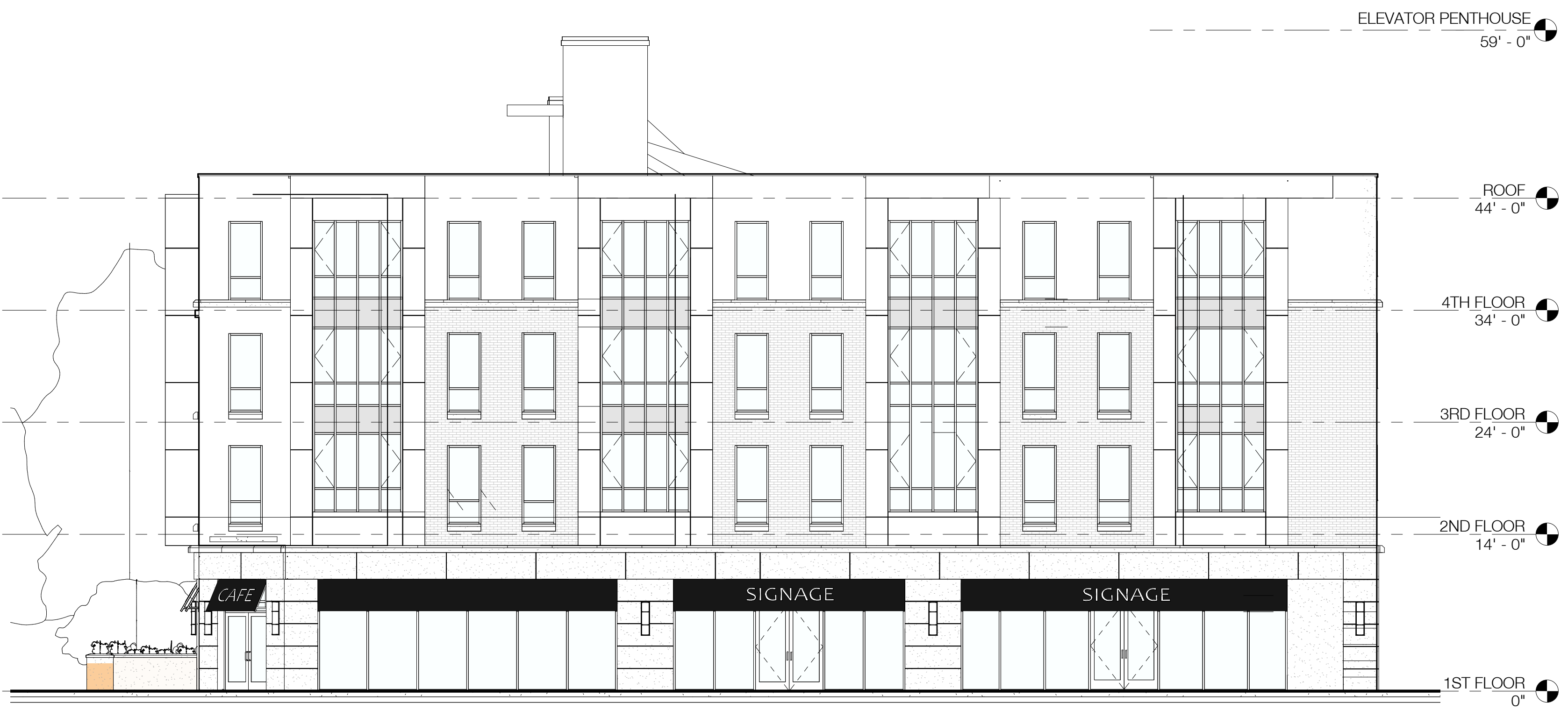
2 WEST ELEVATION 1/8" = 1'-0"