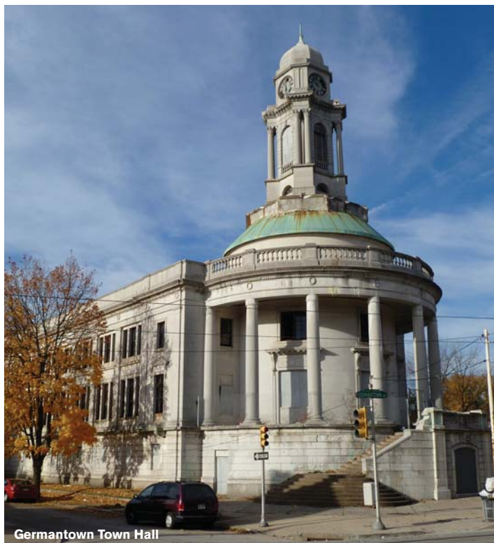
Germantown Town Hall

Owned by the City of Philadelphia, Germantown Town Hall has been vacant since the mid-1990s. Despite being listed as available surplus by the Philadelphia Industrial Development Corporation, no progress has yet been made in identifying a new use for the structure.