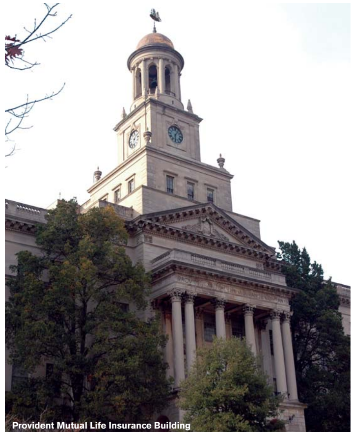
Provident Mutual Life Insurance Building

This imposing West Philadelphia campus, now vacant and owned by the city, is being considered for new Police Department headquarters, but the availability of funding for such a move remains unclear. The building is not listed on the Philadelphia Register of Historic Places, raising concerns about adverse impacts to the building and the site.