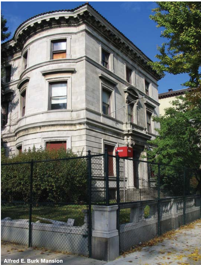
Alfred E. Burk Mansion

Vacant since a fire in 1995, this 1907 beaux-arts mansion continues to face an uncertain future. The building has been owned by Temple University since 1971. Though the school has just completed a stellar rehabilitation of nearby Baptist Temple, Burk Mansion continues to languish without a clear preservation strategy.